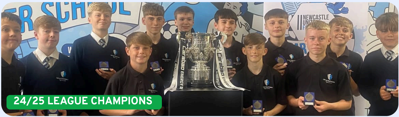
24/25 LEAGUE CHAMPIONS