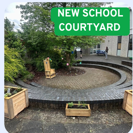
NEW SCHOOL COURTYARD