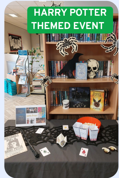
HARRY POTTER THEMED EVENT

Students can attend Book Club and/or Manga Club which run weekly, use the facility for independent study or home learning. Also, look out for themed events throughout the year!